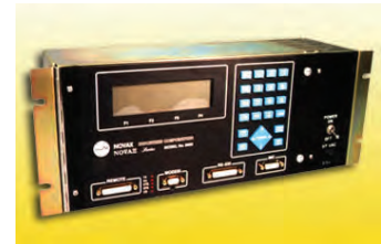
6905 Type 170 Rackmount