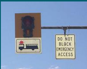
Optional Signs Available