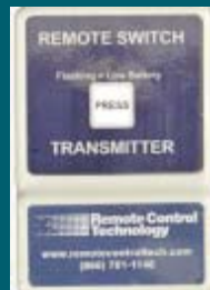
Optional Remote Controls